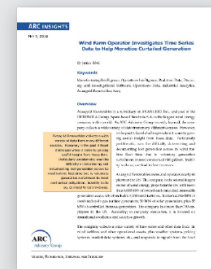
Case Study: Wind Farm Operator Investigates Time Series Data to Help Monetize Curtailed Generation