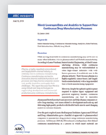
Case Study: Merck Leverages Data and Analytics to Support New Continuous Drug Manufacturing Processes