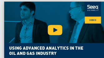
Video: Using Advanced Analytics in the Oil and Gas Industry