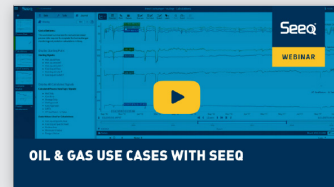
Webinar: Advanced Analytics in the Oil and Gas Industry