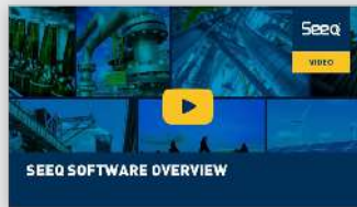
Video: Seeq Overview