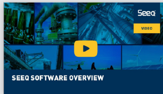
Video: Seeq Overview