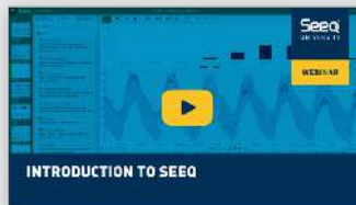
Webinar: Intro to Seeq