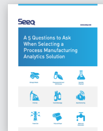
White Paper: 5 Questions to Ask When Selecting a Process Manufacturing Analytics Solutions