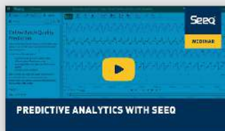
Webinar: Predictive Analytics for Improved Outcomes