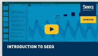
Webinar: Intro to Seeq