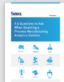
White Paper: 5 Questions to Ask When Selecting a Process Manufacturing Analytics Solutions