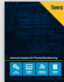
Brochure: Seeq Overview