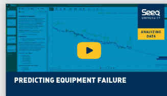
Video: Predicting Equipment Failure