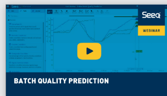
Video: Predicting batch quality with advanced analytics